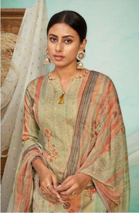
Her smile, her style and most importantly her dresses are objects which enchant the mind, body and soul.