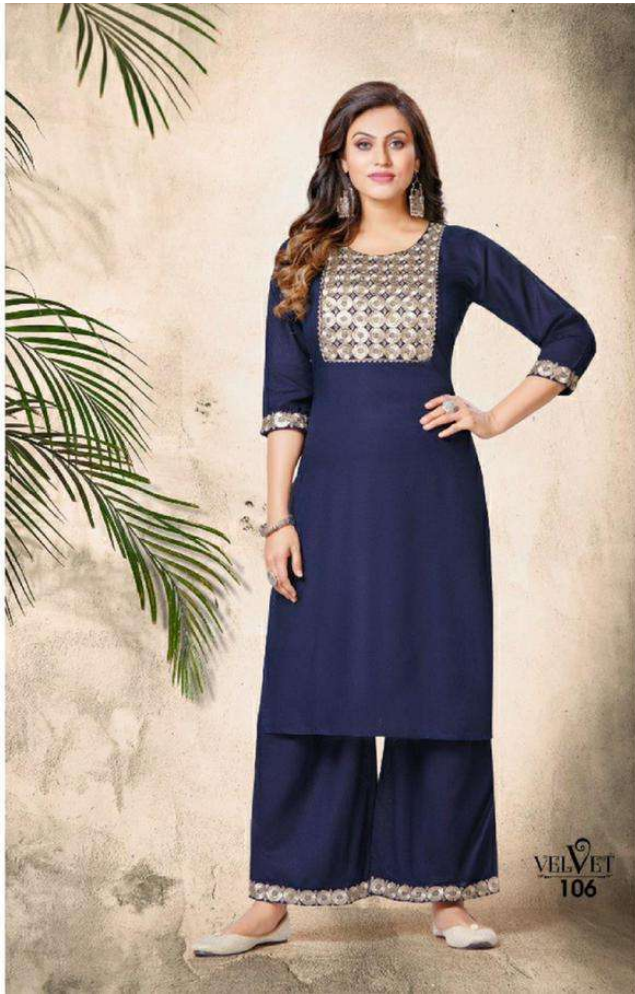
A look for three main qualities in a dress - how good it looks, fresh style and it wear any day everywhere