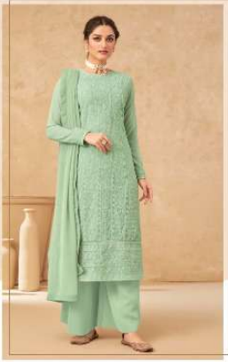
-: 41014 :-