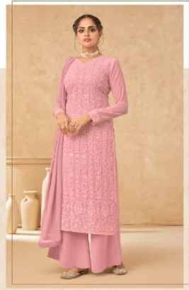
-: 41016 :-