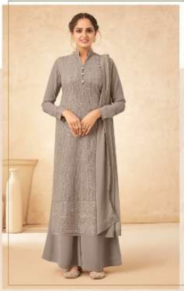
-: 41012 :-