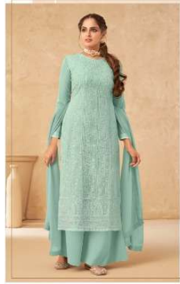
-: 41017 :-