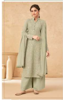
-: 41015 :-