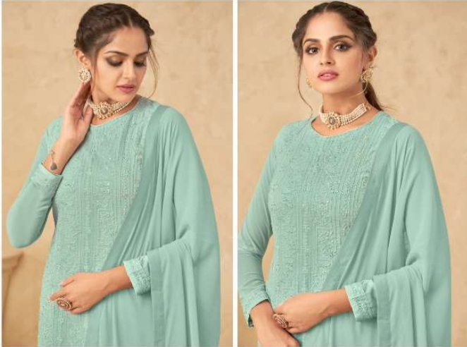
Fashion is not something that exists in dresses only. Fashion is in the sky, in the street. Fashion has to do with ideas, the way we live, what is happening.