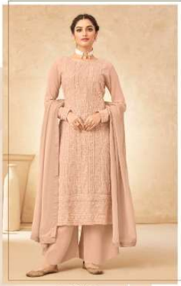
-: 41013 :-