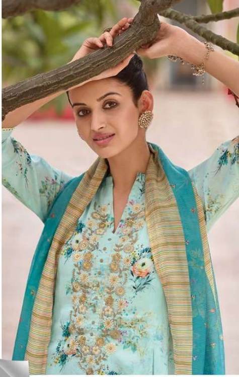
CLASSIC STYLES WITH LUXURIOUS SOFT FABRICS ARE HIGHLIGHTED BY REFINED AND FEMININE DETAILS