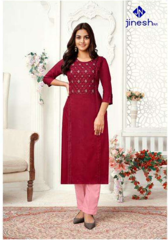
D NO. 1003