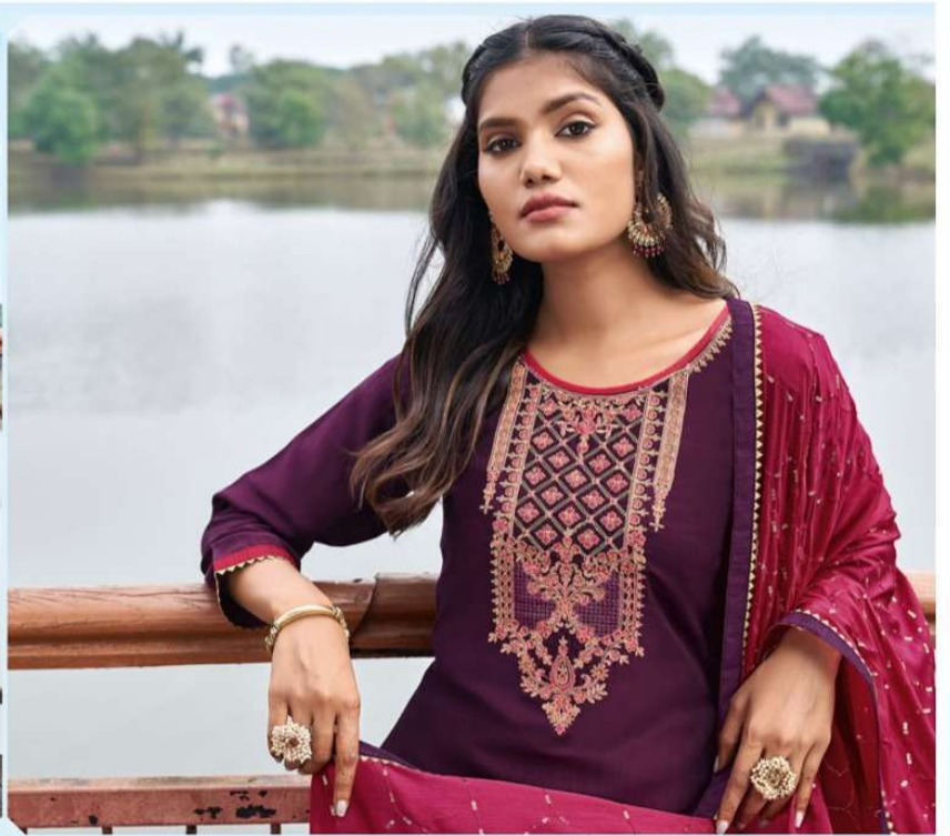
GLAMOROUS • TRENDY • FASHIONISTA Vi - 74