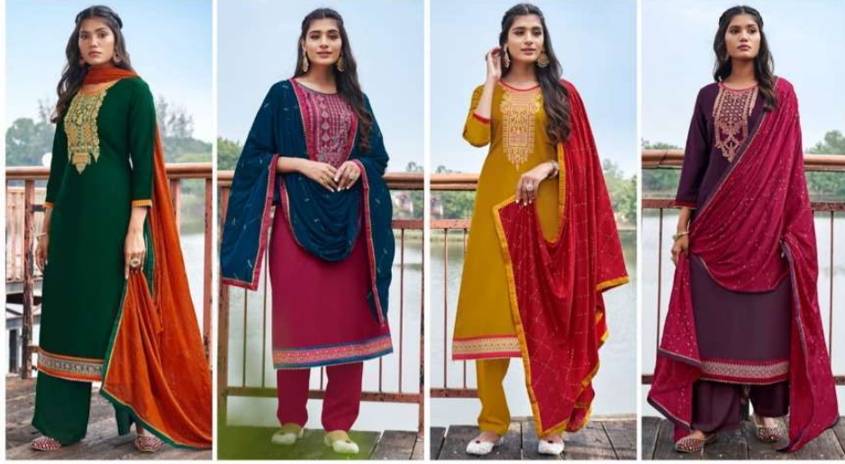
Vi - 71