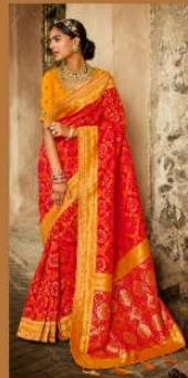
D. NO.- 2210