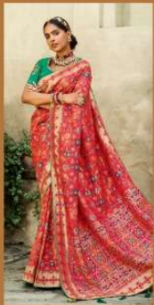
D. NO.- 2204