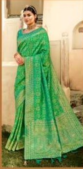
D. NO.- 2202