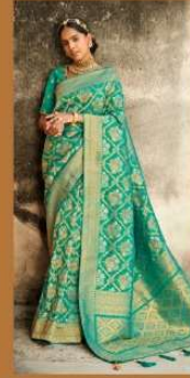
D. NO.- 2208