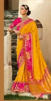
D. NO.- 2209