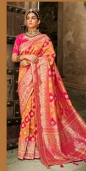
D. NO.- 2212