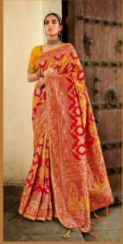
D. NO.- 2201