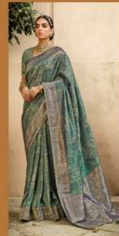
D. NO.- 2211