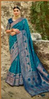
D. NO.- 2205