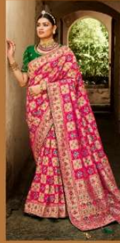
D. NO.- 2207