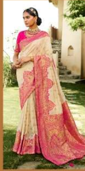
D. NO.- 2203