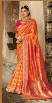
D. NO.- 2206