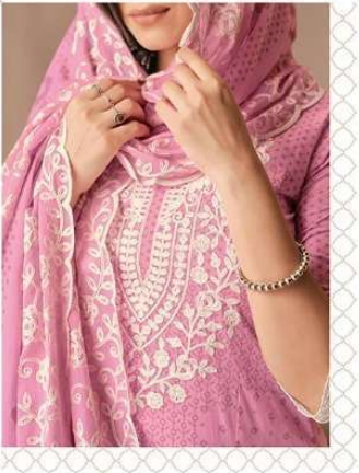
6587 Immerse yourself in unexpected, bright colors & Textures