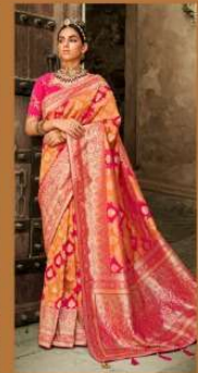
D. NO.- 2212