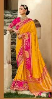
D. NO.- 2209