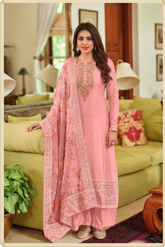
Nyra - 1374