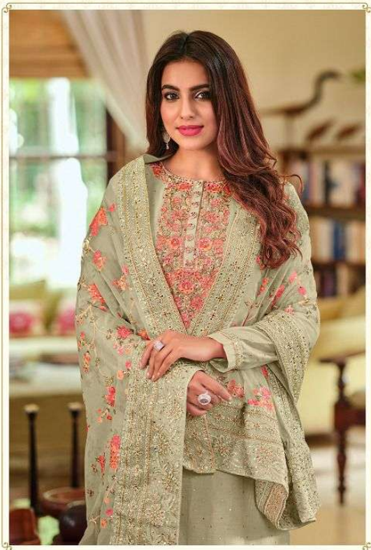
Nyra - 1373