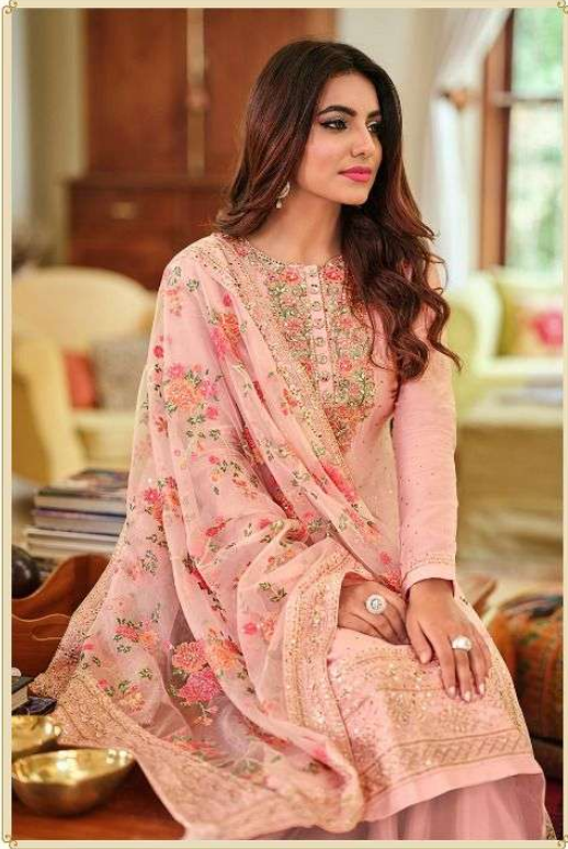
Nyra - 1371