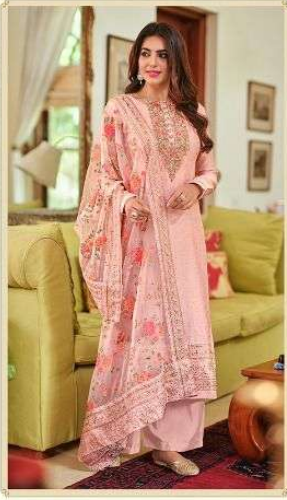
Nyra - 1371