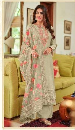
Nyra - 1373