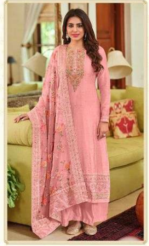
Nyra - 1374