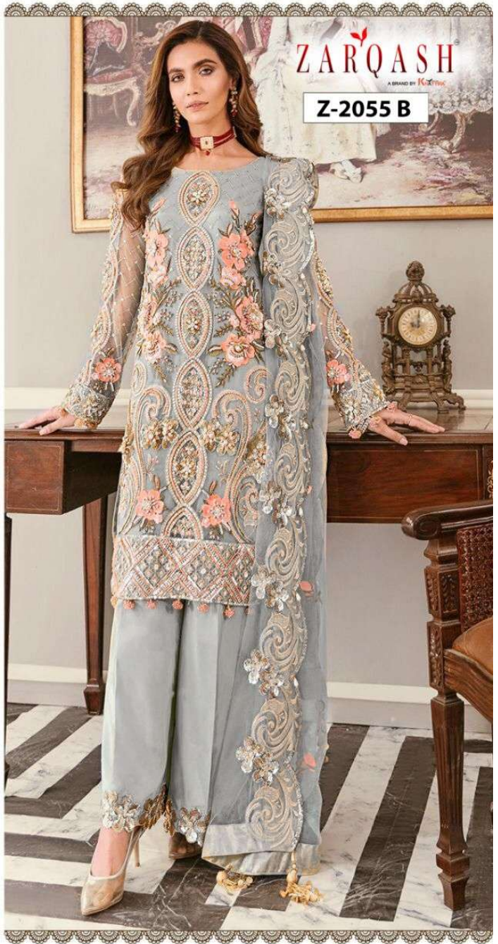
Top - Butterfly net heavy embroidered Inner Bottom - Santoon silk Dupatta - Butterfly net heavy embroidered