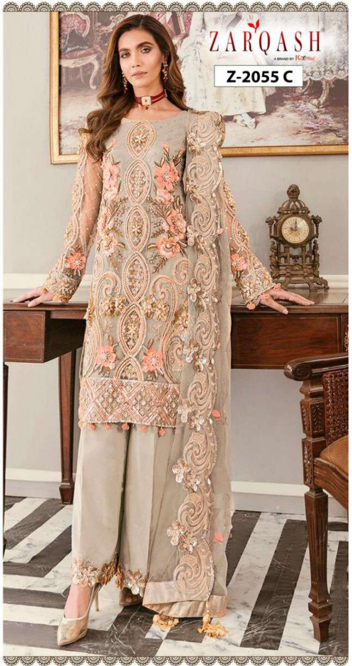
Top - Butterfly net heavy embroidered Inner Bottom - Santoon silk Dupatta - Butterfly net heavy embroidered