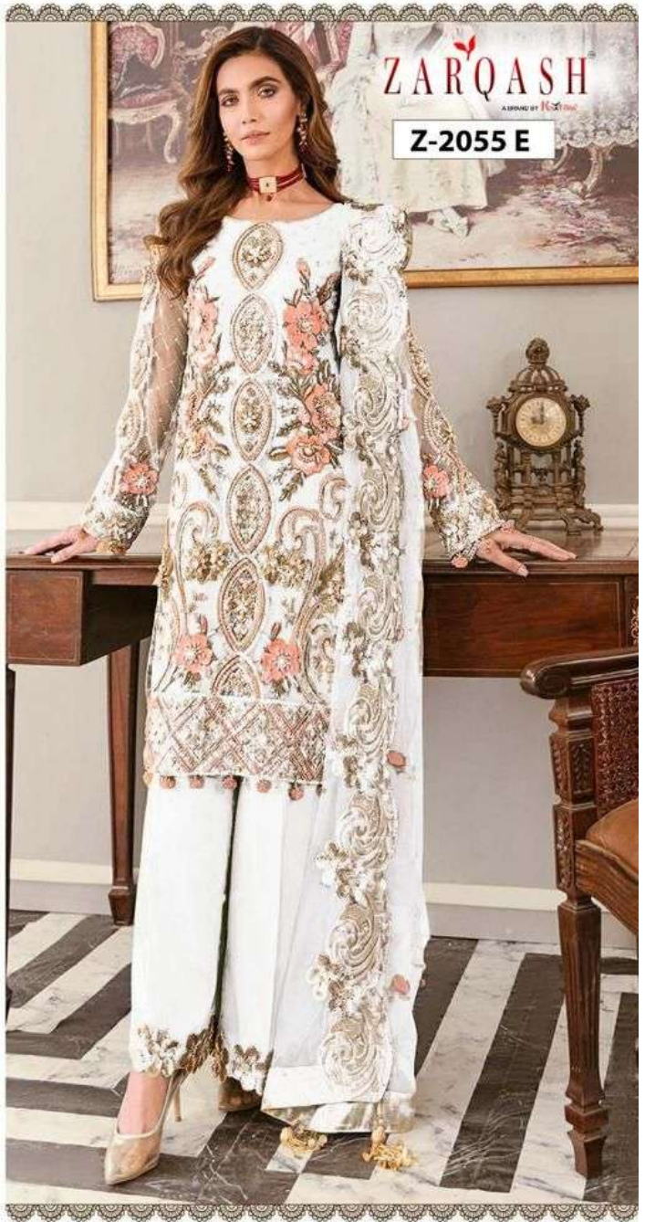
Top - Butterfly net heavy embroidered Inner Bottom - Santoon silk Dupatta - Butterfly net heavy embroidered