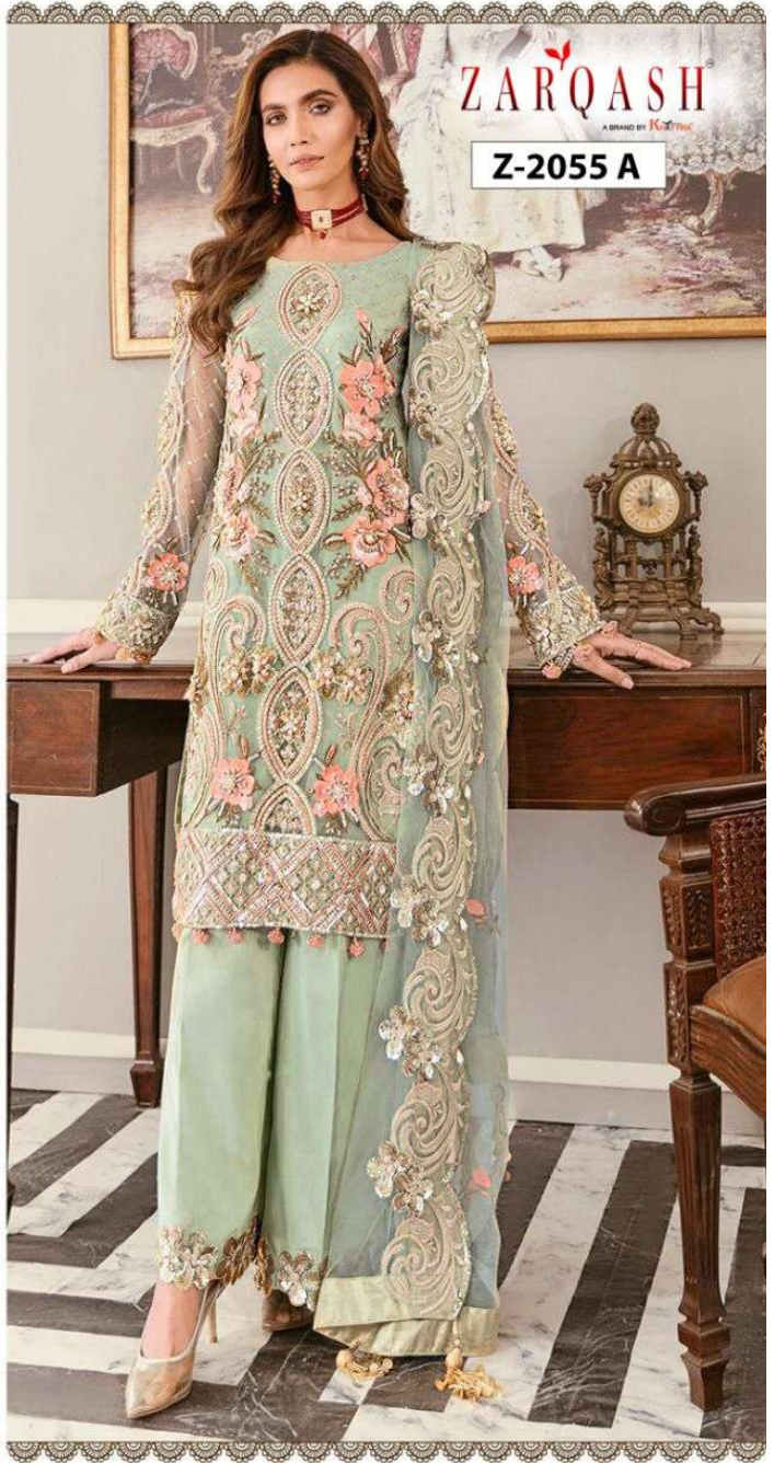
Top - Butterfly net heavy embroidered Inner Bottom - Santoon silk Dupatta - Butterfly net heavy embroidered