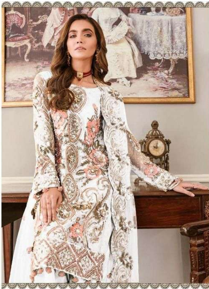
Top - Butterfly net heavy embroidered Inner Bottom - Santoon silk Dupatta - Butterfly net heavy embroidered