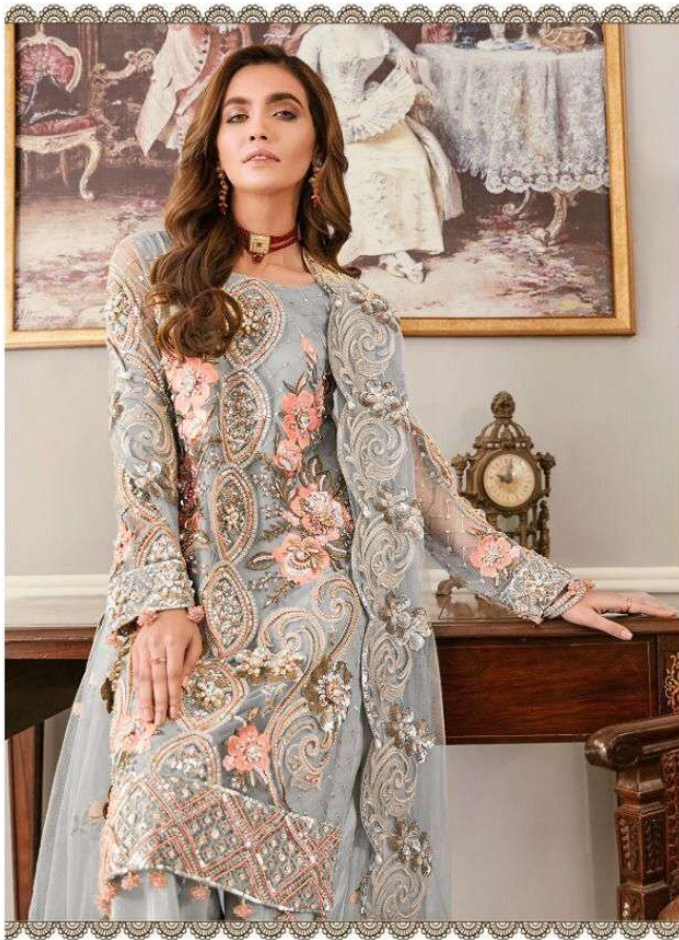
Top - Butterfly net heavy embroidered Inner Bottom - Santoon silk Dupatta - Butterfly net heavy embroidered