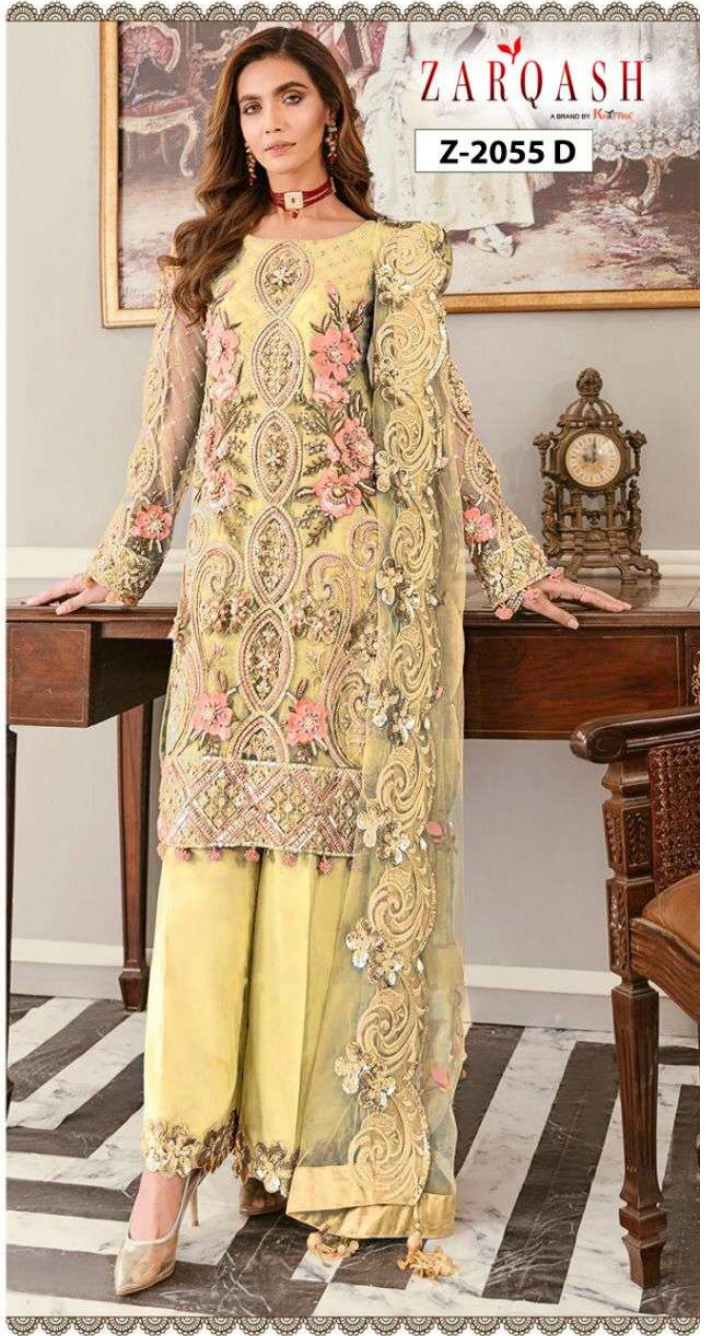
Top - Butterfly net heavy embroidered Inner Bottom - Santoon silk Dupatta - Butterfly net heavy embroidered