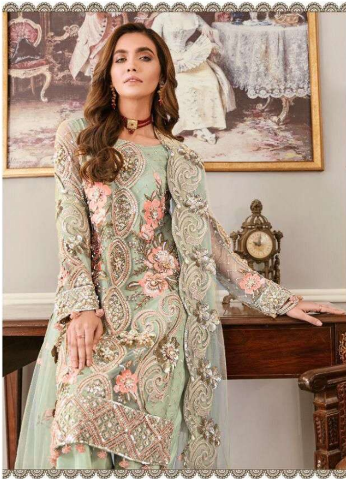
Top - Butterfly net heavy embroidered Inner Bottom - Santoon silk Dupatta - Butterfly net heavy embroidered