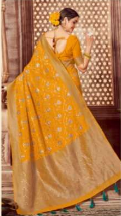
classic outfits with a twist of interesting detailing, subtle sheen, rich texture is perfectly wrapped in panache giving style a new meaning and refresh your wardrobe to Indian culture.