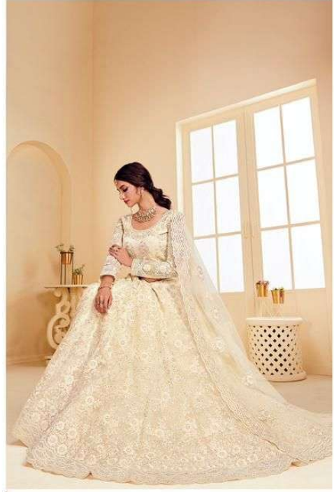
Simple without letting us of elegance & tradition with natural fabrics. 1003-D