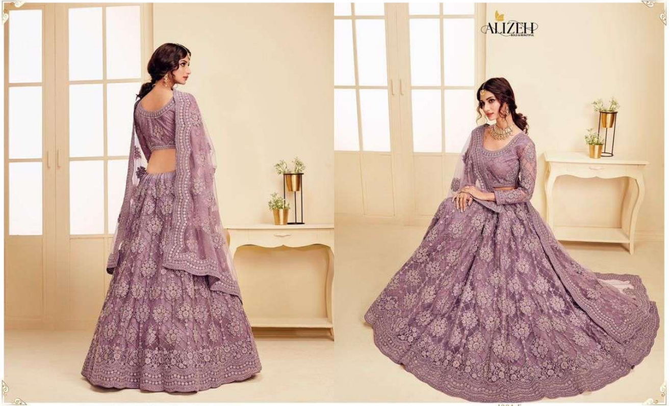
This season, your look gets better definition with just a little attention to detail