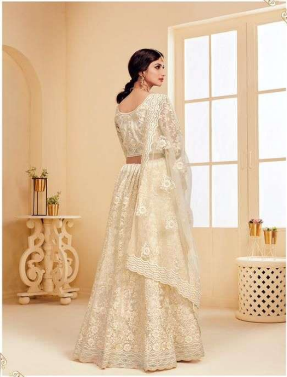
The key is to contrast two elements so you don't end up seeing being the feminine quality