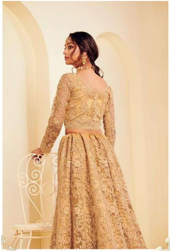
Lace fabric, bold pattern & softness detailing adds modern silhouette