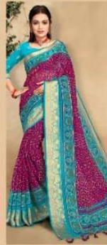
D. NO. 1006