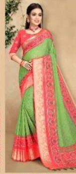
D. NO. 1004