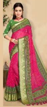
D. NO. 1001