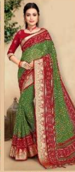
D. NO. 1003