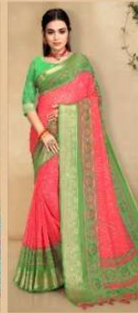
D. NO. 1007