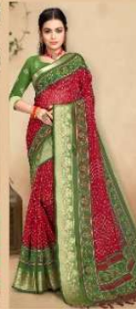
D. NO. 1008