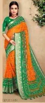
D. NO. 1002