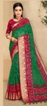
D. NO. 1005