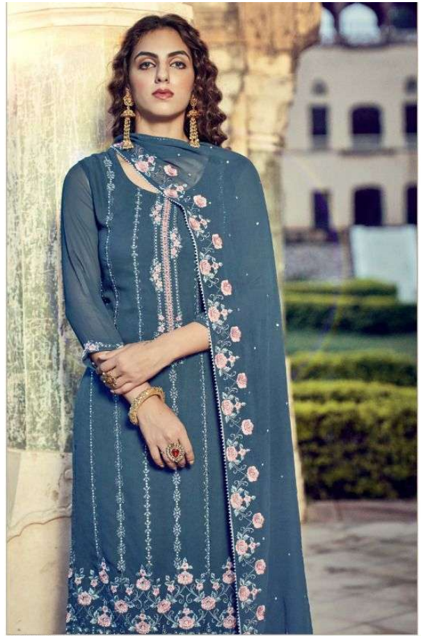
The vibrant elements of Indian Fashion from all over world's culture.