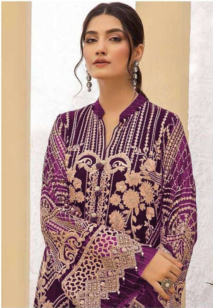
Top - Fox Georgette heavy embroidered Inner Bottom - Heavy Santoon Dupatta - Nazneen heavy embroidered