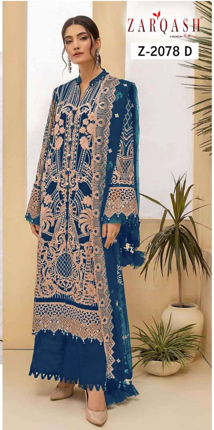
Top - Fox Georgette heavy embroidered Inner Bottom - Heavy Santoon Dupatta - Nazneen heavy embroidered