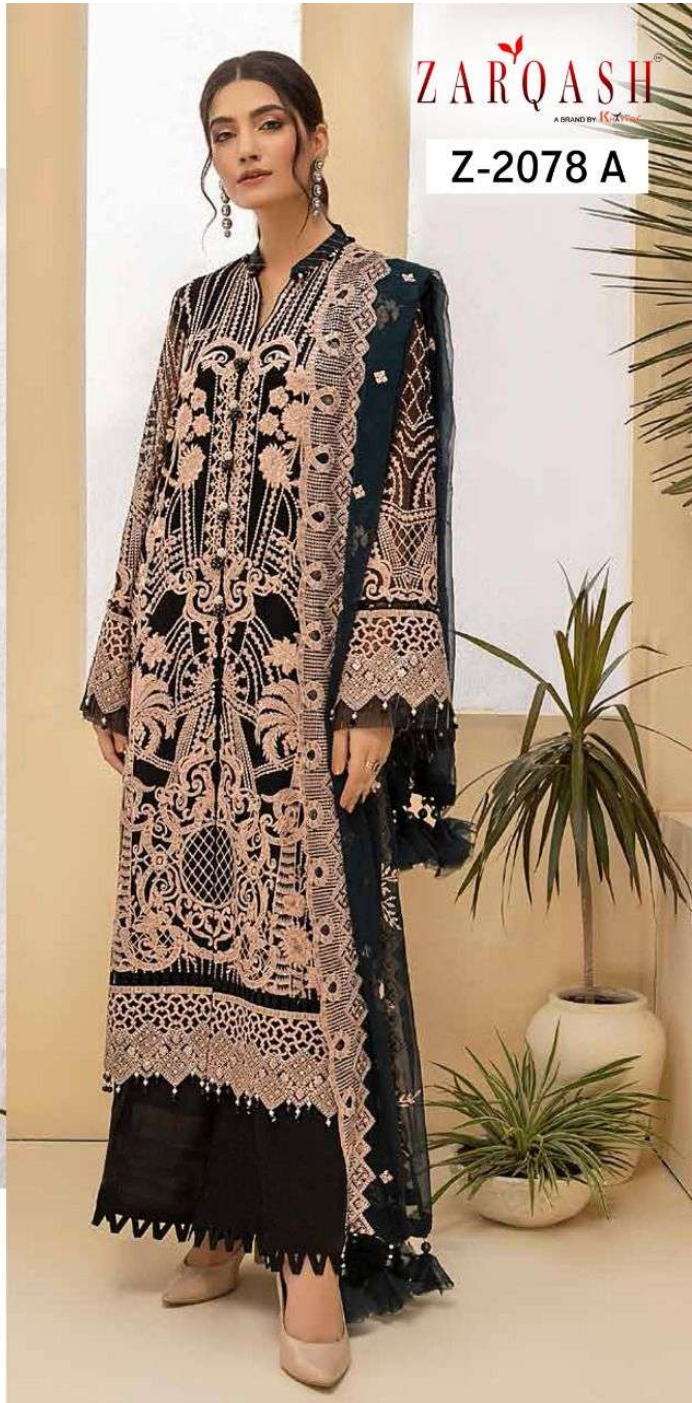
Top - Fox Georgette heavy embroidered Inner Bottom - Heavy Santoon Dupatta - Nazneen heavy embroidered