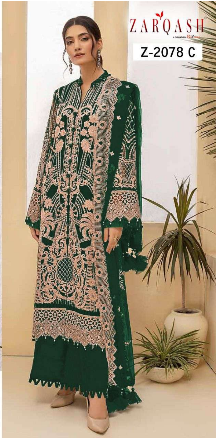
Top - Fox Georgette heavy embroidered Inner Bottom - Heavy Santoon Dupatta - Nazneen heavy embroidered