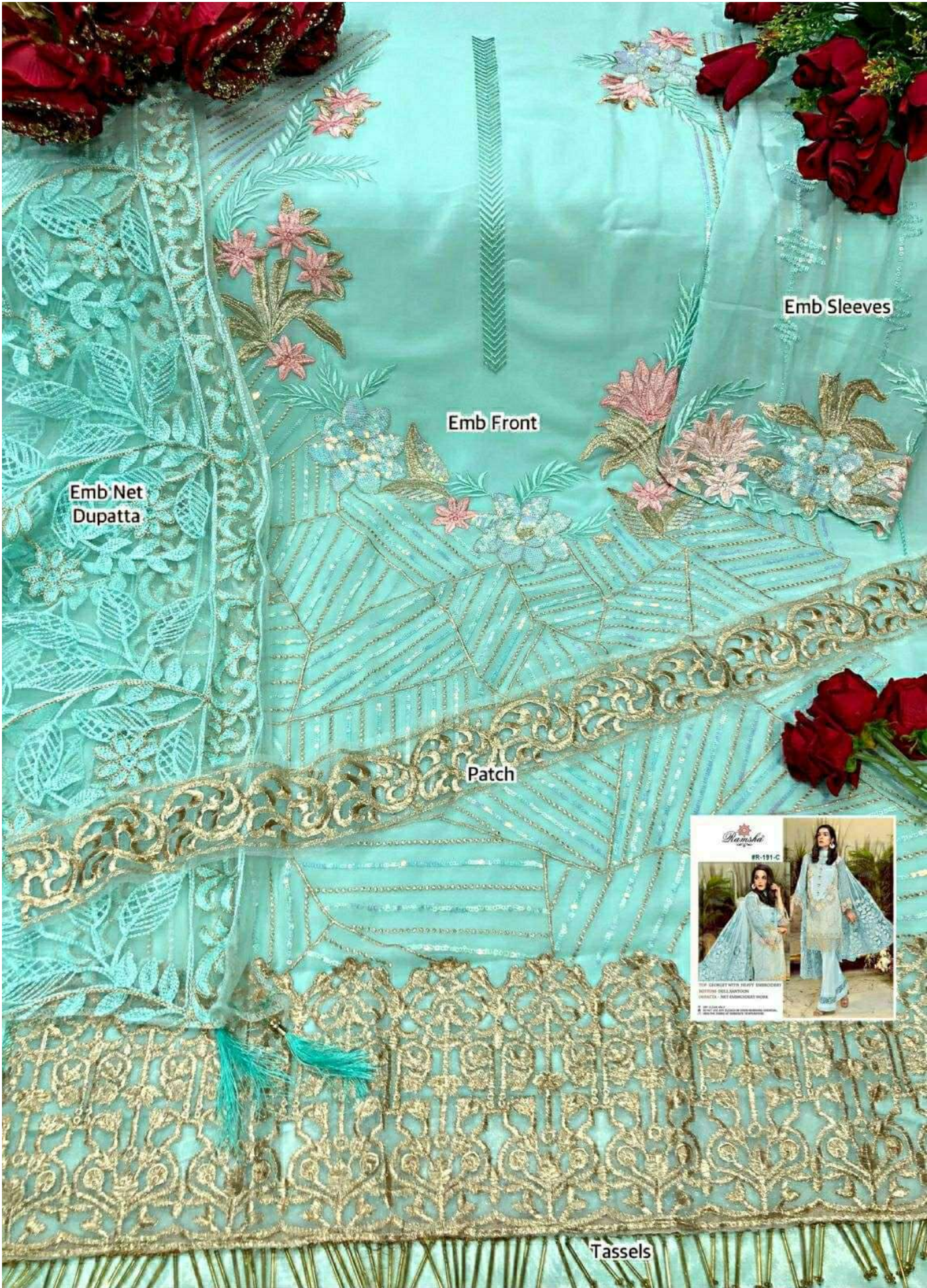
Emb Net Dupatta