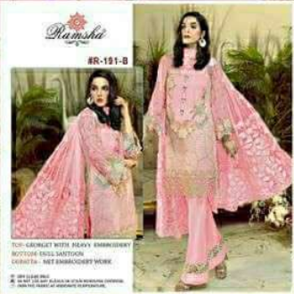
TOP-GARMENT WITH HEAVY EMBROIDERY BOTTOM-FULL SKIRT DUPATTA- NET EMBROIDERY WITH FRINGE