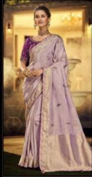
D. NO. : 1503