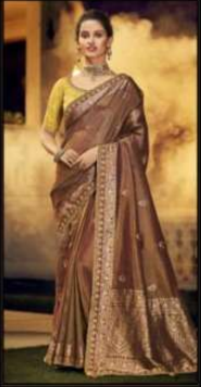
D. NO. : 1501