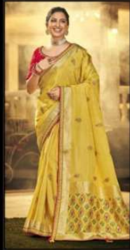
D. NO. : 1506