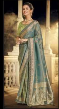
D. NO. : 1509