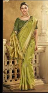
D. NO. : 1508