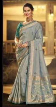
D. NO. : 1507