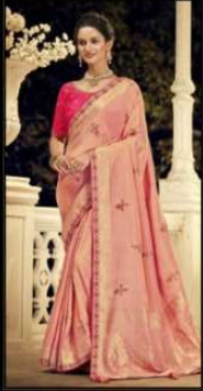
D. NO. : 1502