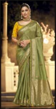
D. NO. : 1504