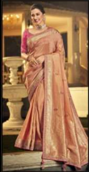
D. NO. : 1505