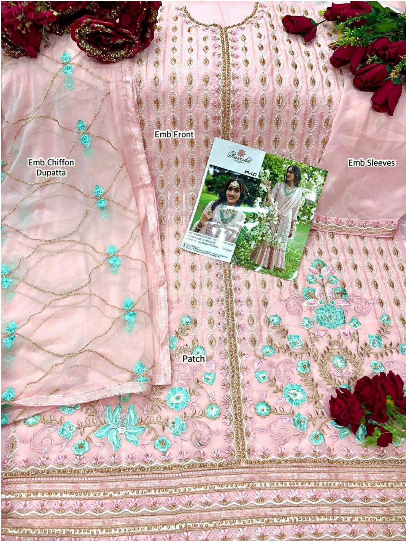
Emb Chiffon Dupatta