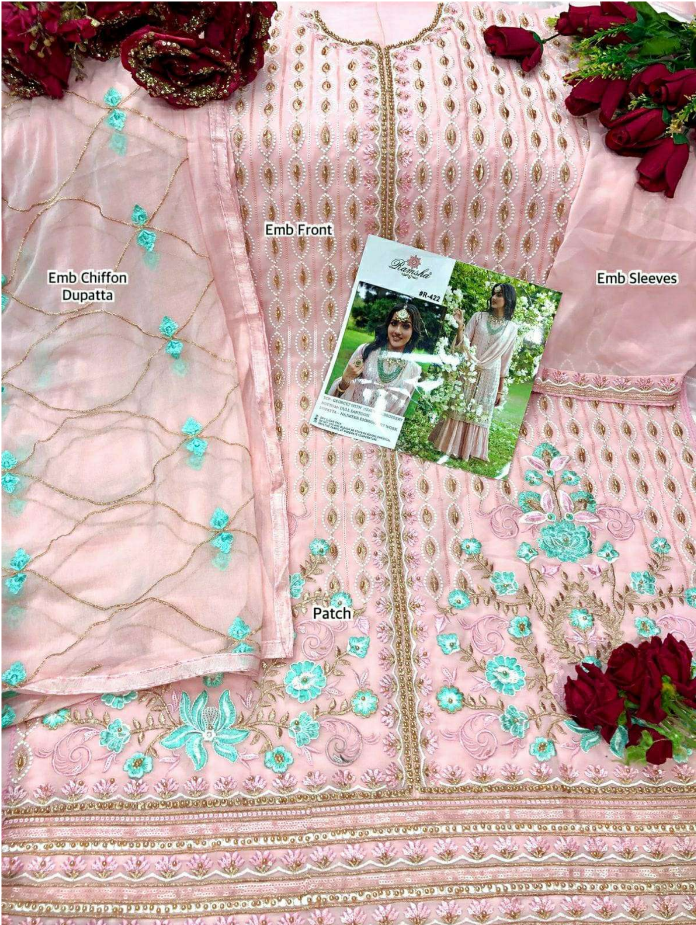
Emb Chiffon Dupatta