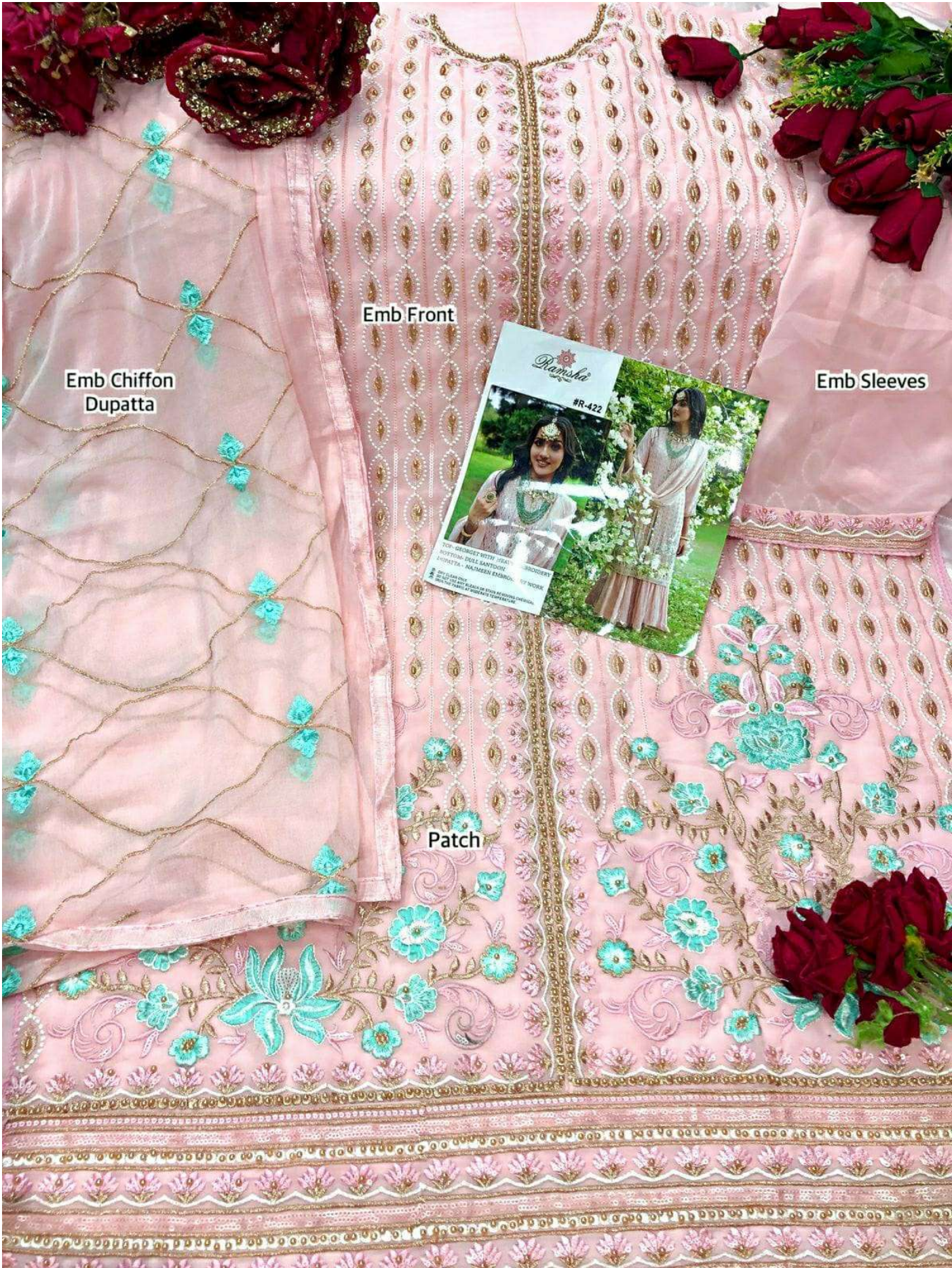
Emb Chiffon Dupatta