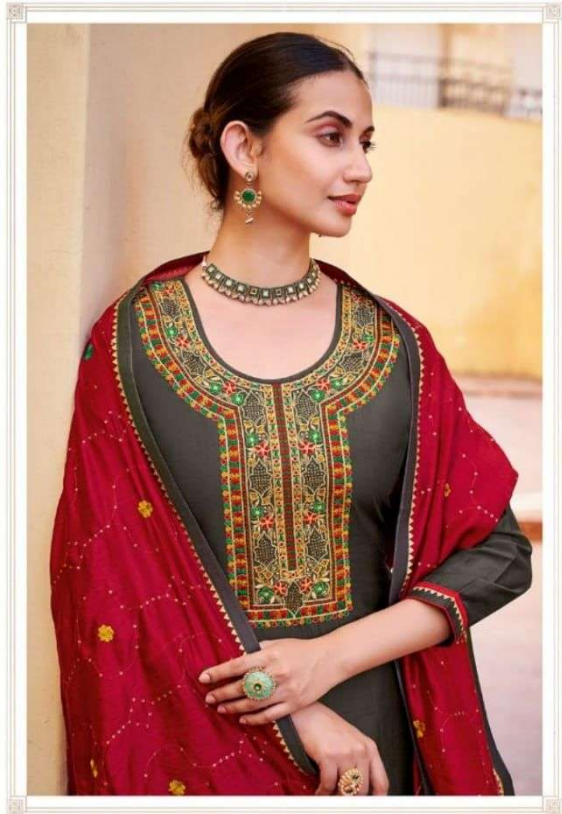
FREE — 3353 — SPIRIT