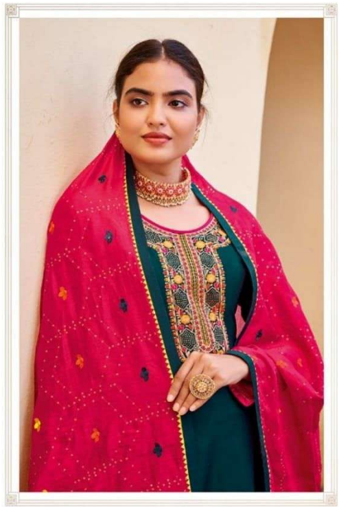
GLAM — 3351 — DIVA