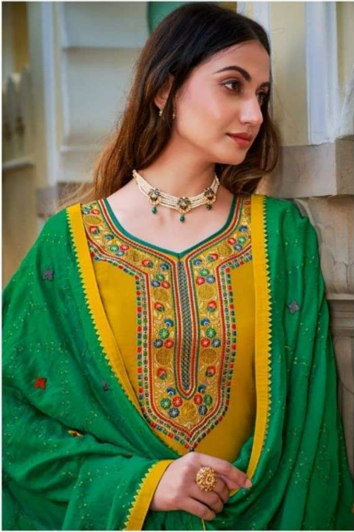
GLAM — 3352 — DIVA