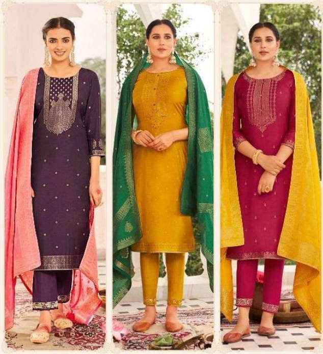
❖ D.NO.12807 ❖