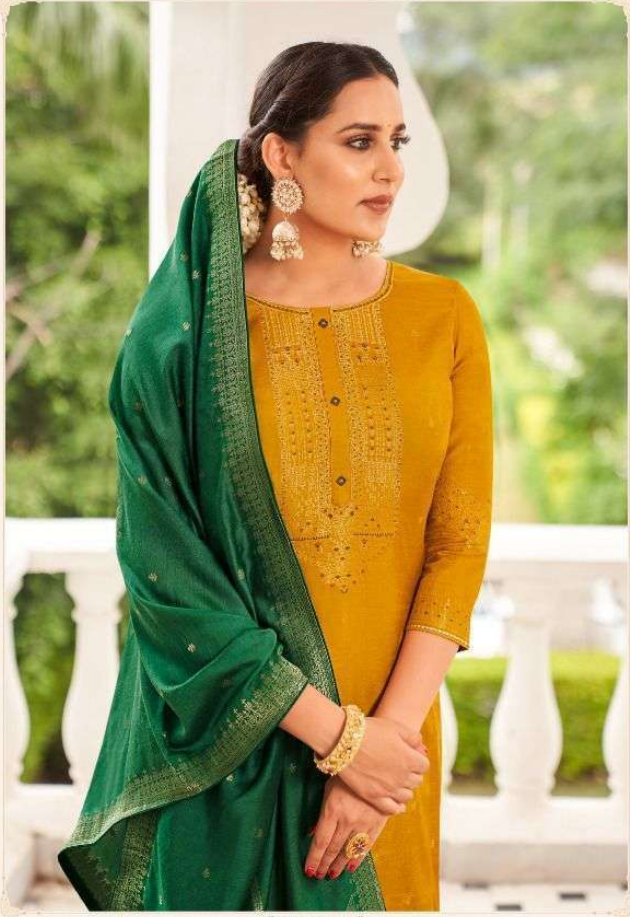
❁ D.NO.1280 ❁