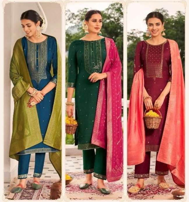
❖ D.NO.12810 ❖