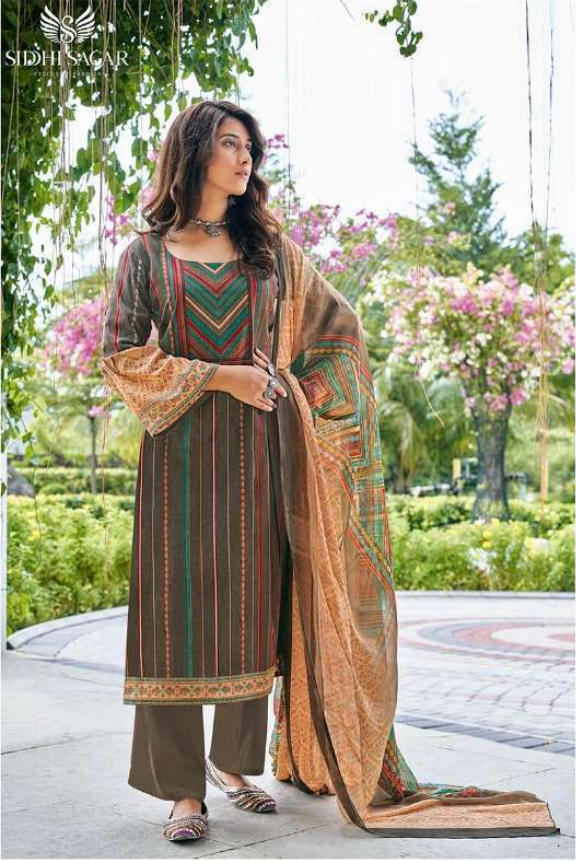
LUXE FABRICS, BOLD PATTERNS & SUMPTUOUS DETAILING ADORN MODERN SILHOUETTES