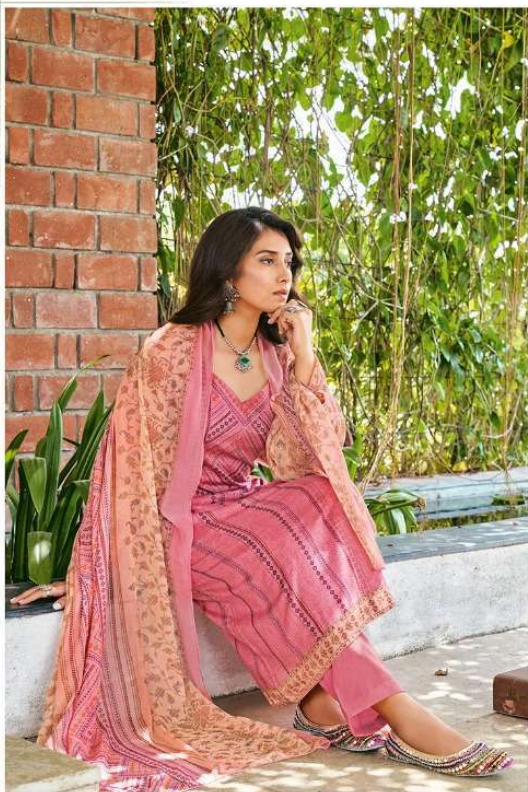
OUR MUSE FOR THIS SEASON IS STRONG, ELEGANT AND NEVER COMPROMISE COMFORT