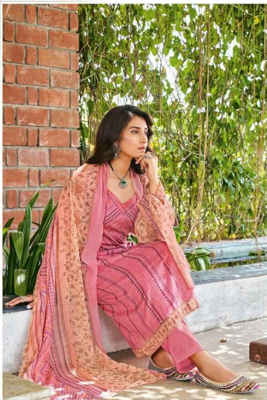
OUR MUSE FOR THIS SEASON IS STRONG, ELEGANT AND NEVER COMPROMISE COMFORT