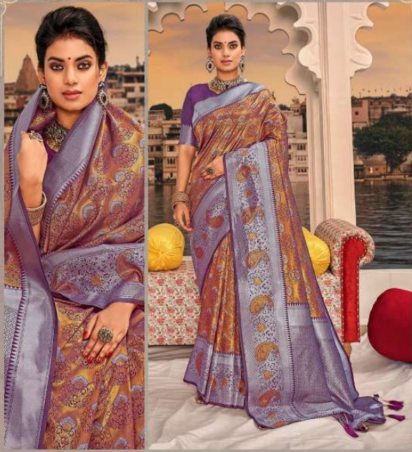
Looks like a pretty princess emerged from the glitzy shine.