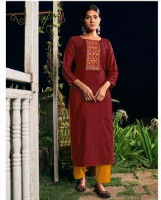
{ 3.3.6.8 }