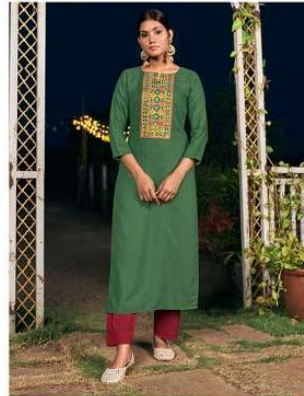
{ 3.3.6.7 }