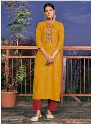
{ 3.3.6.3 }