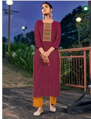
{ 3.3.6.4 }