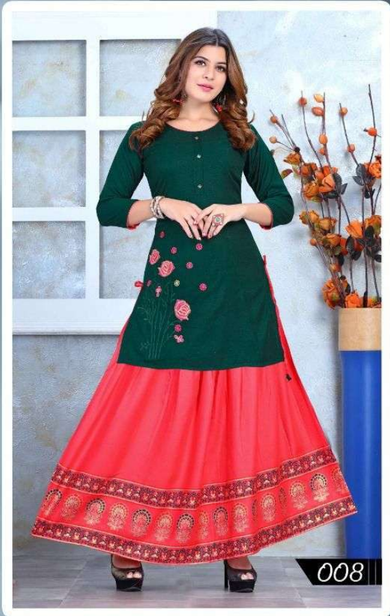
Spreading joy she lives in a world where all is glamorous. Amidst the cameras she thrives, smiles, fun and excitement. When all is beautiful, she's alive.