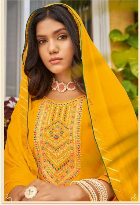
EXCLUSIVE LOOKS designed for the festive fever 3372