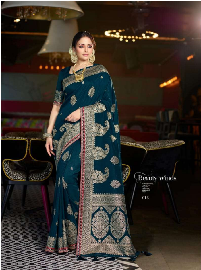
Beauty winds 013