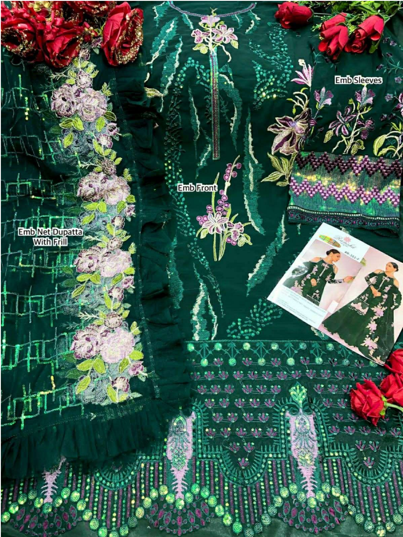
Emb Net Dupatta With Frill