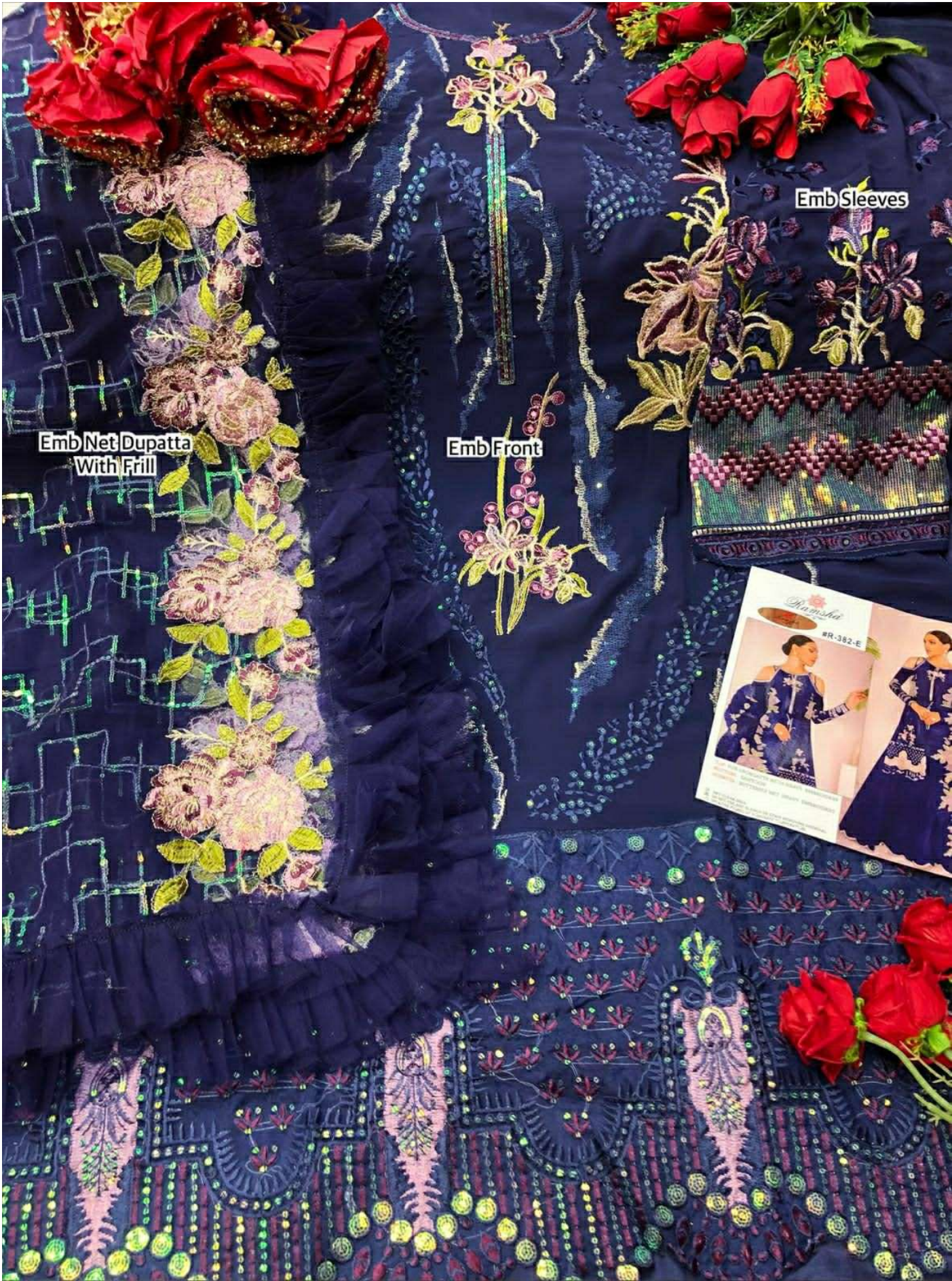
Emb Net Dupatta With Frill