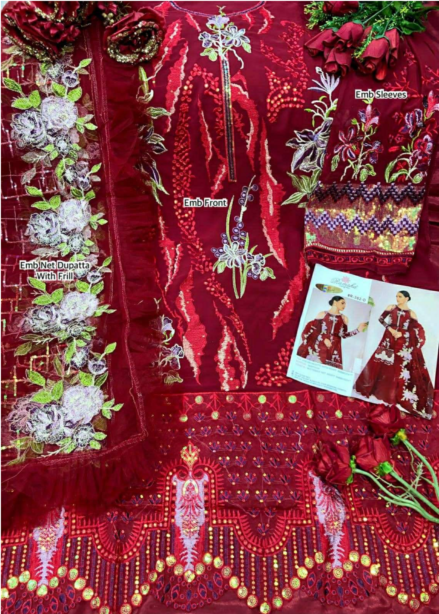
Emb Net Dupatta With Frill