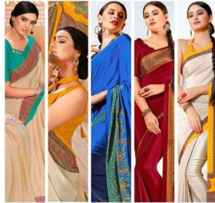
8612 B 8612 C 7607 B 7610 A 7611 C