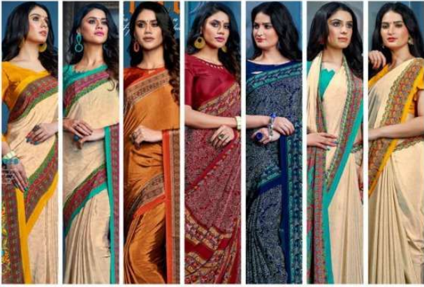
8804 A 8804 B 8805 A 8806 B 8806 C 8807 A 8807 B