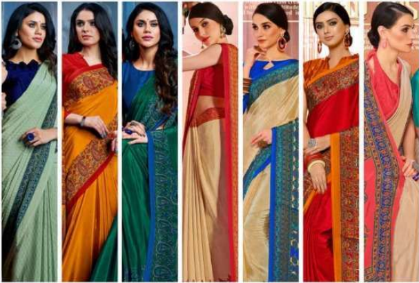
8814 B 8817 B 8817 C 8605 A 8605 B 8606 B 8612 A