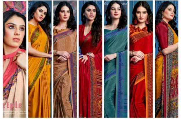
8807 C 8808 A 8808 B 8809 A 8809 B 8812 B 8814 A