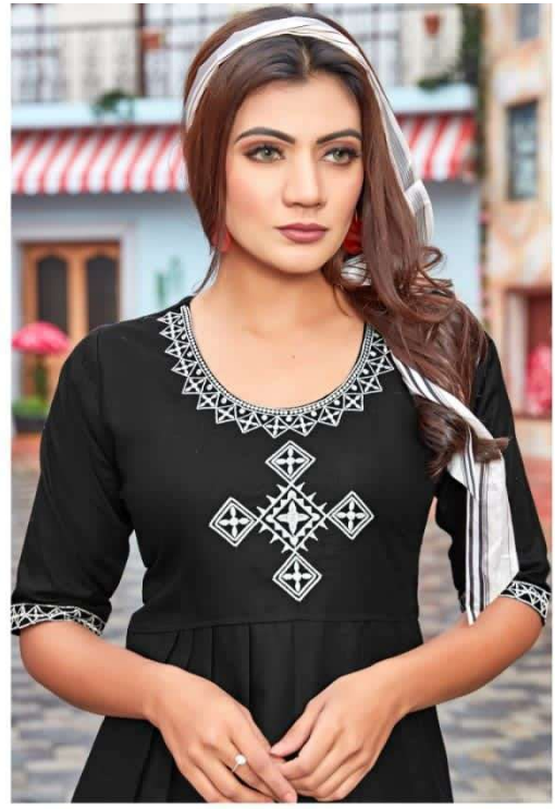
PRIMAL INSTINCTS 5009