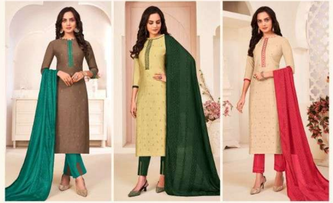
☆ 43004 ☆