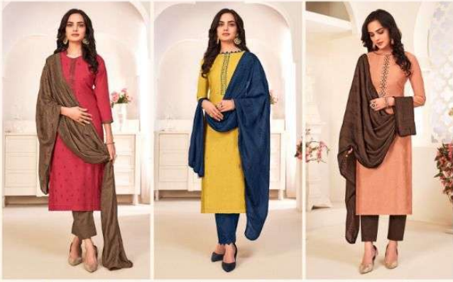
☆ 43001 ☆