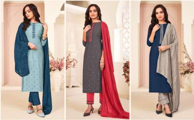
☆ 43007 ☆