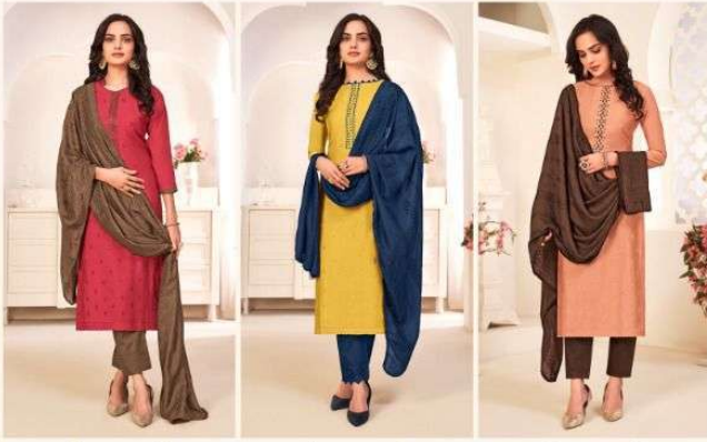
☆ 43001 ☆