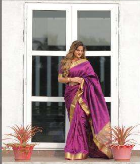
MAGIC LEAF 1001