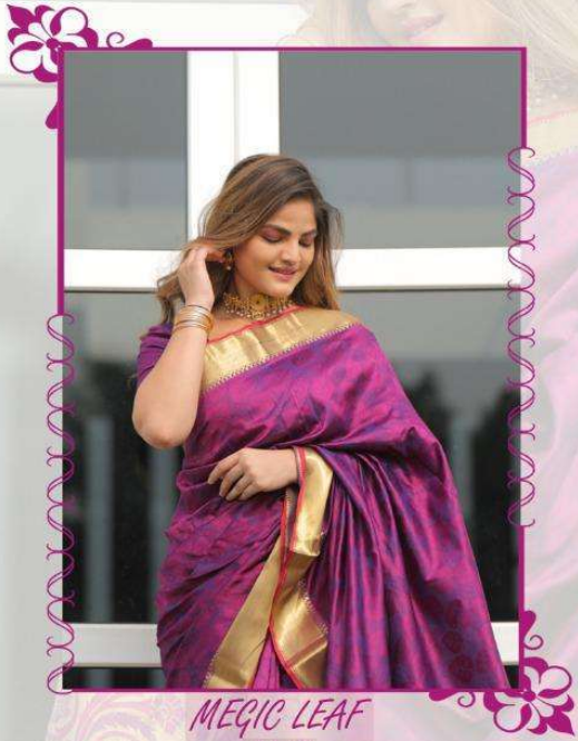
MAGIC LEAF 1001