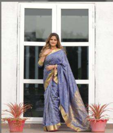
MAGIC LEAF 1005