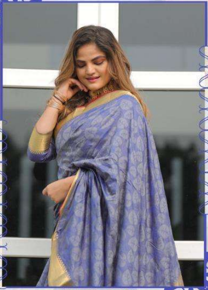
MAGIC LEAF 1005