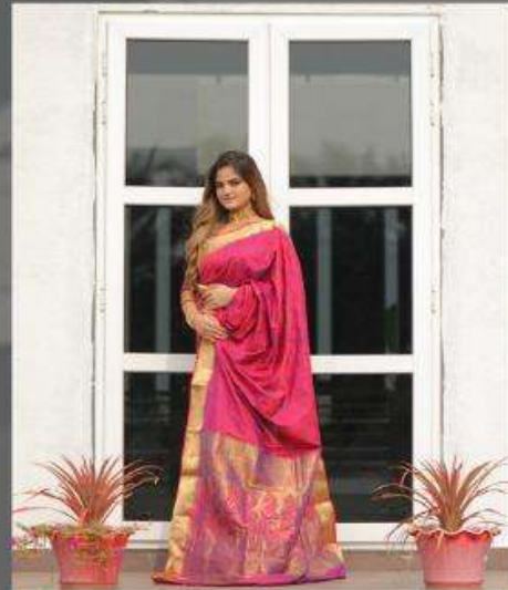
MAGIC LEAF 1004