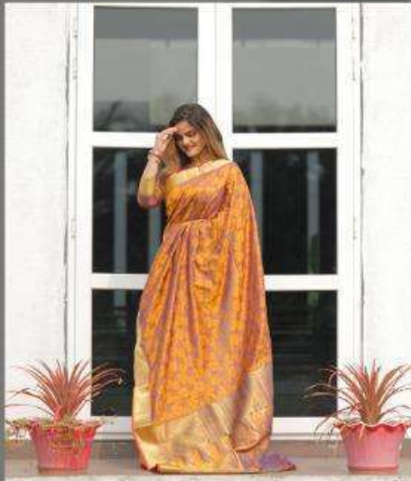
MAGIC LEAF 1003