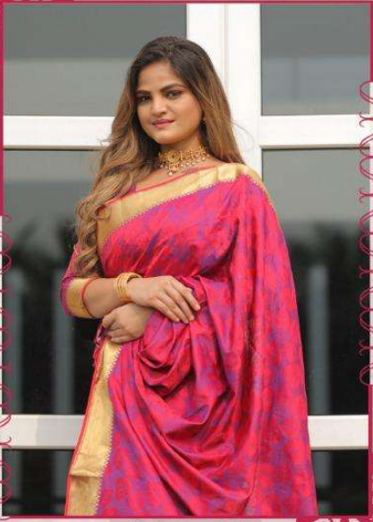
MEGIC LEAF 1004