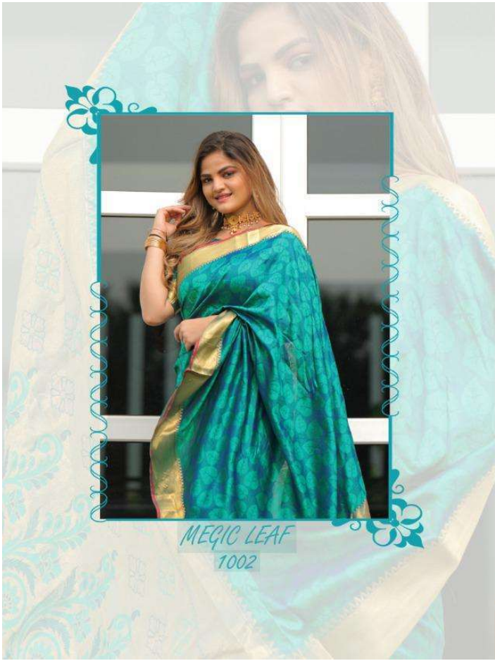
MAGIC LEAF 1002