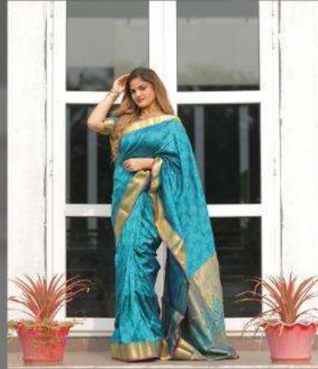
MAGIC LEAF 1002