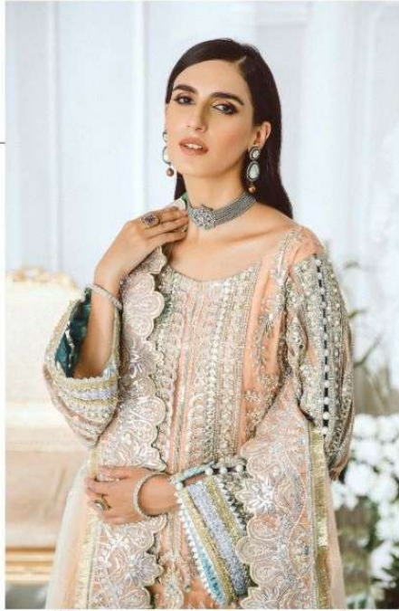
The art of designing Luxury style...