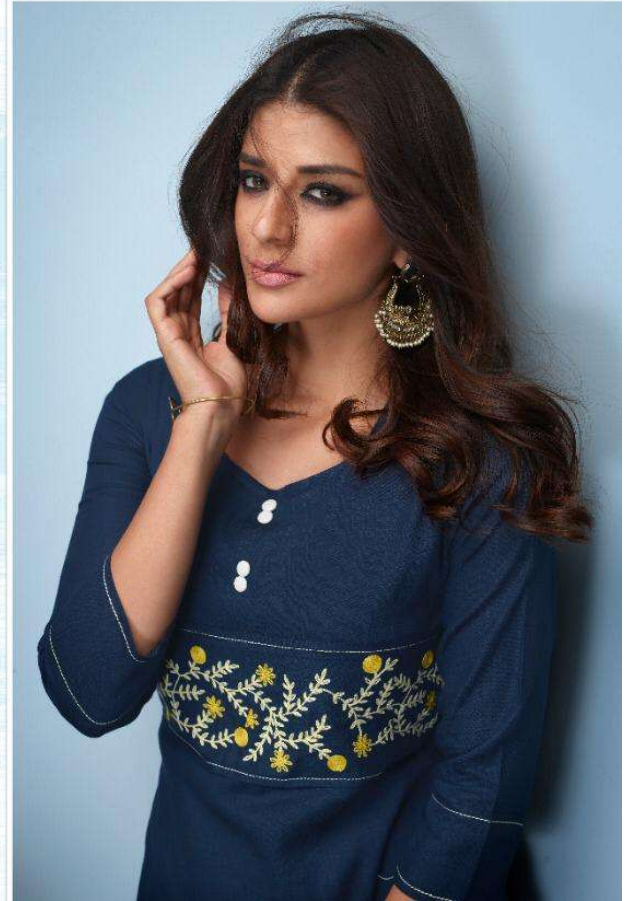
The grace and dignity which only a dress can impart. The piece of artistry of this dress tell altogether a different story.