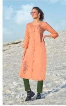
✦ 1005 ✦