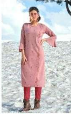
✦ 1002 ✦