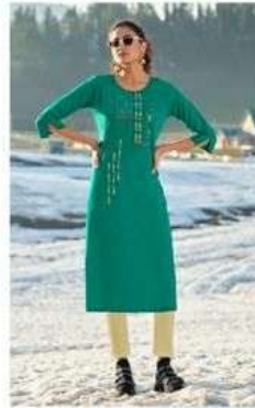
✦ 1007 ✦