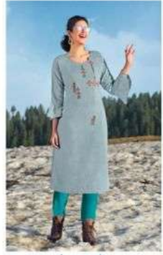
✦ 1006 ✦