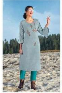
✦ 1006 ✦