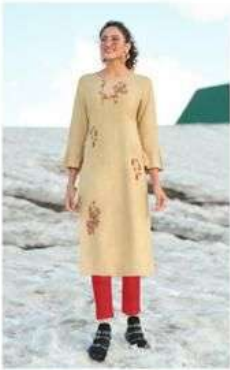
✦ 1003 ✦