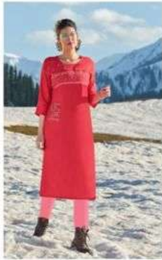
✦ 1004 ✦