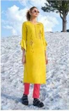
✦ 1001 ✦