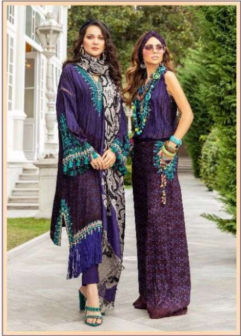
MARIYA.B. EXCLUSIVE COLLECTION VOL-3