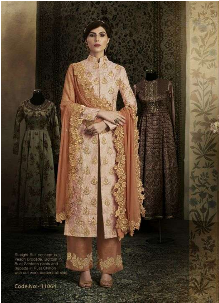
Straight Suit concept in Peach Brocade. Bottom in Rust Santoon pants and dupatta in Rust Chiffon with cut work borders all side.