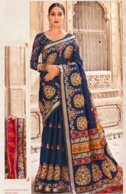
P.C. _ 106