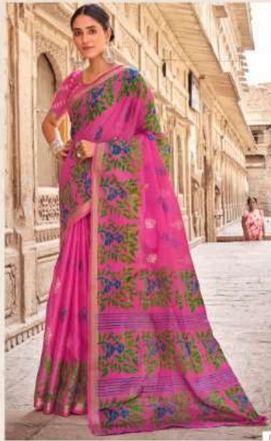
P.C. _ 105