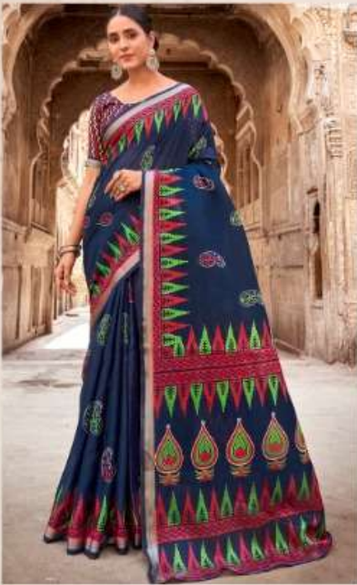
P.C. _ 104