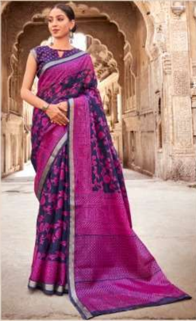
P.C. _ 101