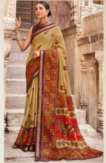
P.C. _ 103