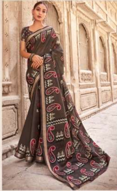
P.C. _ 102