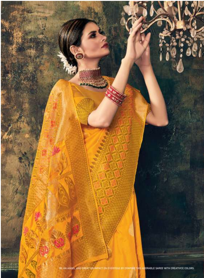
BE AN ANGEL AND CREATE AN IMPACT ON EVERYONE BY DRAPING THIS ADORABLE SAREE WITH CREATIVE COLORS.