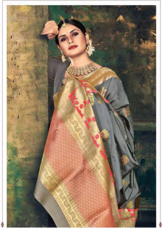
REVEAL YOUR STYLE WITH THIS HIGHLY ADORNED SAREE CREATED FOR THAT SPECIAL SUMMER OCCASION