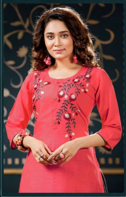
stand attention for styles latest construction, combination pattern with collection makes it reliable.