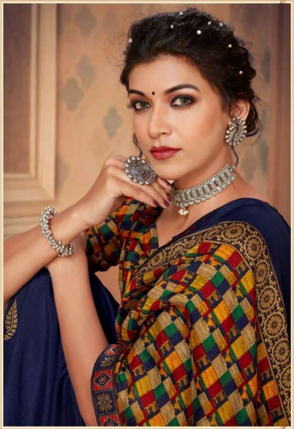
The beauty of the Indian women with gracefully drops in effulgent sarees..