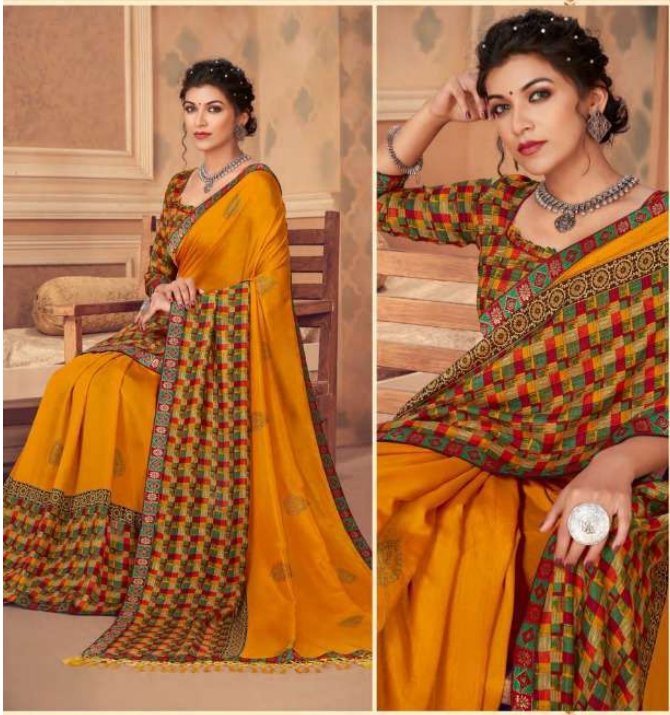
Embrace womanly attire that take inspiration from the feminine of the tradition swatting its way to a season invited with imagination fabulous designs to look beautiful.