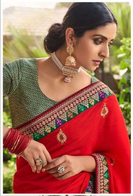
RED BARFI SILK EMBROIDERED SAREE. HAVING EMBROIDERED LACES AND TUSSELS. PAIRED WITH GREEN BROCADE BLOUSE.