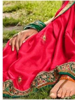
HANI BARTI SILK EMBROIDERED SAREE, HAVING EMBROIDERED LACES AND TUSSELS, PAIRED WITH GREEN BROCADE BLOUSE