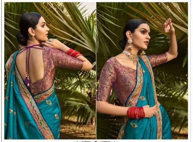
TEROZI BARFI SILK EMBROIDERED SAREE, HAVING EMBROIDERED LACES AND TUSSELS, PAIRED WITH WINE BROCADE BLOUSE