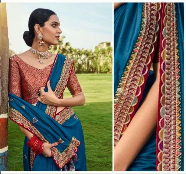
PETROL BLUE PAFFI SILK EMBROIDERED SAREE, HAVING EMBROIDERED LACE AND TUSSELS, PAIRED WITH RED BROCADE BLOUSE