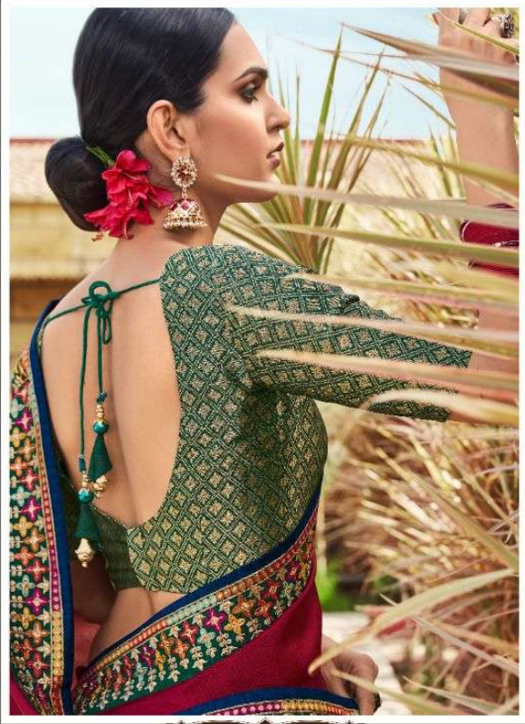
MAROON BARFI BILK EMBROIDERED SAREE, HAVING EMBROIDERED LACES AND TUSSELS, PAIRED WITH GREEN BROCADE BLDUSE