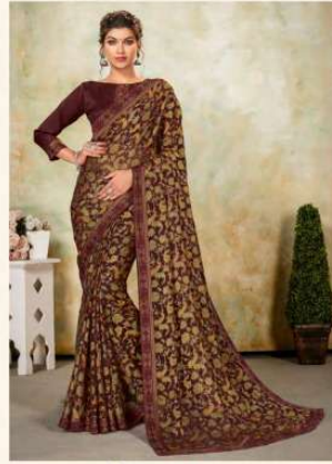
❁ Code # E