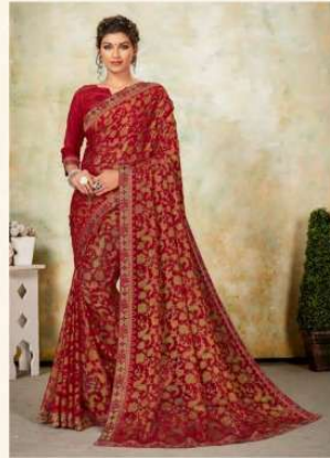
❁ Code # G