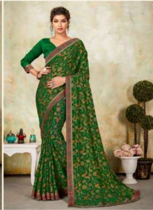
❁ Code # D