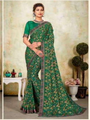
❁ Code # F