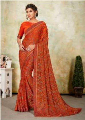
❁ Code # C