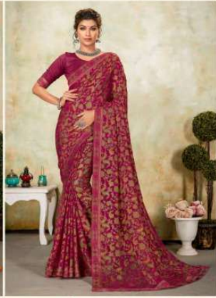
❁ Code # B