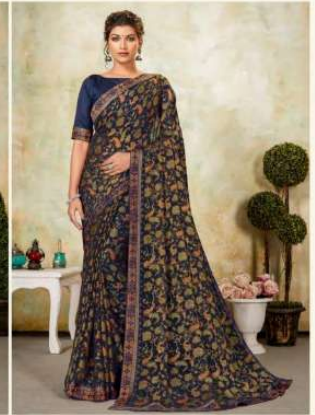
❁ Code # H