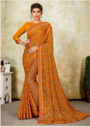
❁ Code # A