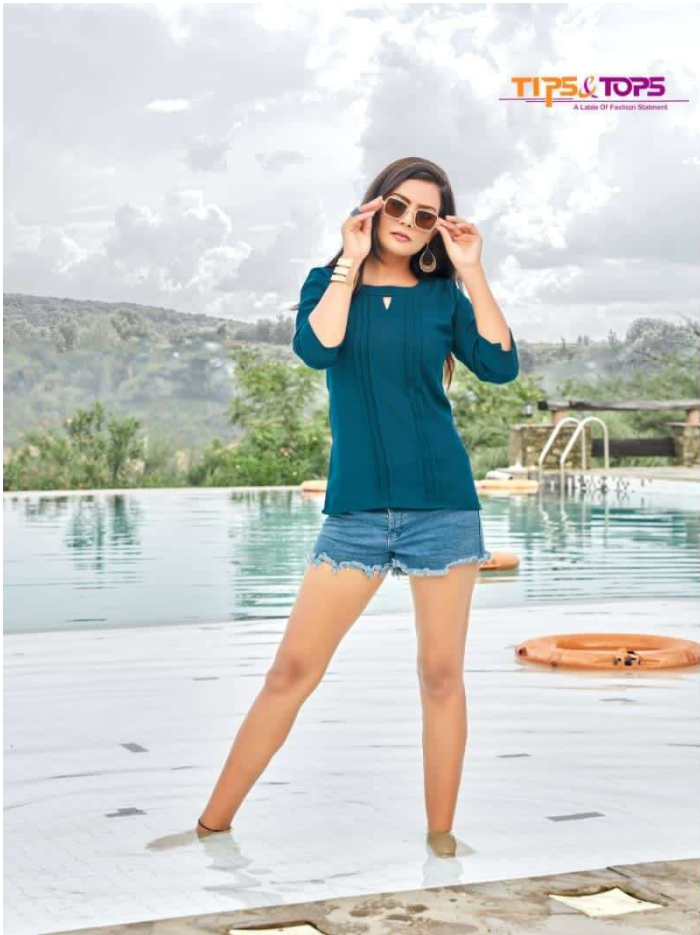
Fashion up with this grey apex top