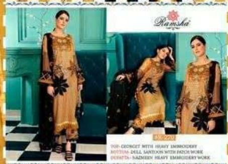
Ramsha TOP: GEORGETT WITH HEAVY EMBROIDERY BOTTOM: DILLI SARKISON WITH PATCH WORK DUPATTA: NAZKHEEN HEAVY EMBROIDERY WORK