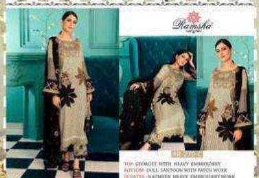
TOP - GEOMETRIC WITH HEAVY EMBROIDERY BOTTOM - SCALLOPED WITH BEAD WORK DUPATTA - KAZMIEN HEAVY EMBROIDERY WORK