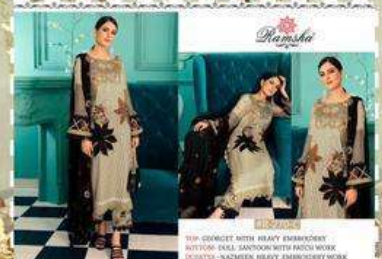
TOP - GEOMETRIC WITH HEAVY EMBROIDERY BOTTOM - GULLI SHANTOON WITH PATCH WORK DUPATTA - KAZMIEN HEAVY EMBROIDERY WORK