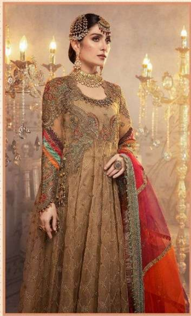
EMBROIDERED MARIYA.B. Vol-15