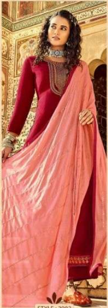
STYLE : 2902