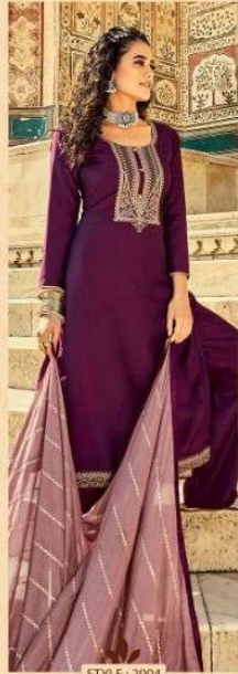
STYLE : 2904