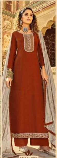
STYLE : 2906