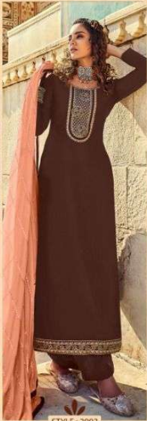
STYLE : 2903