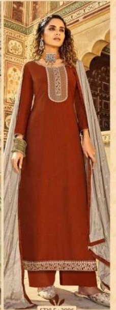
STYLE : 2906