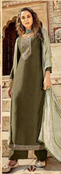
STYLE : 2905