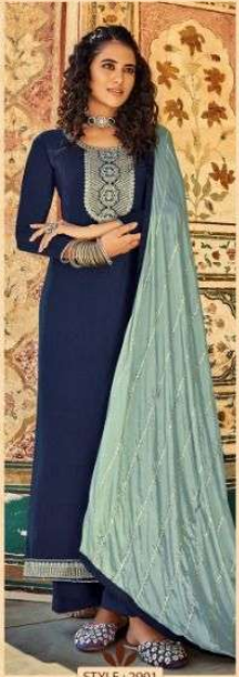
STYLE : 2901