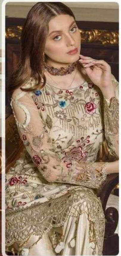
D.NO.108 FABRIC DETAILS: TOP:- NET DUPATTA:- NET INNER:- SANTOON BOTTOM:- SANTOON