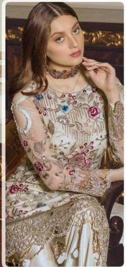
D.NO.108-A FABRIC DETAILS: TOP:- NET DUPATTA:- NET INNER:- SANTOON BOTTOM:- SANTOON