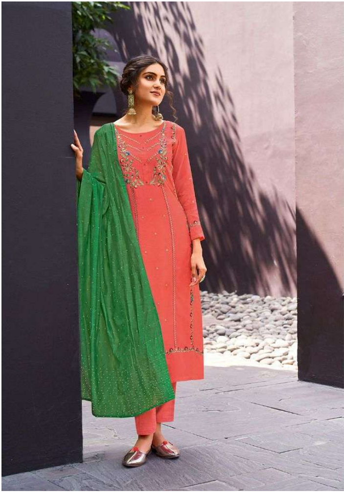
Different cultures come together in a village in Punjab's biggest moment this season 3251