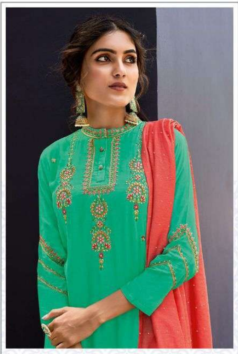
Classic style with timeless soft fabrics are highlighted by refined and feminine details 3254